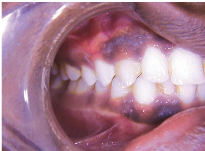
Fig. 2: Occlusion on the left side