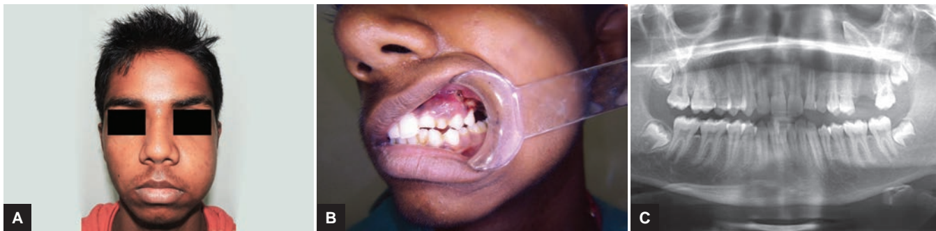
Figs 1A to C: (A) Frontal view; (B) occlusion on left side; and (C) orthopantomogram