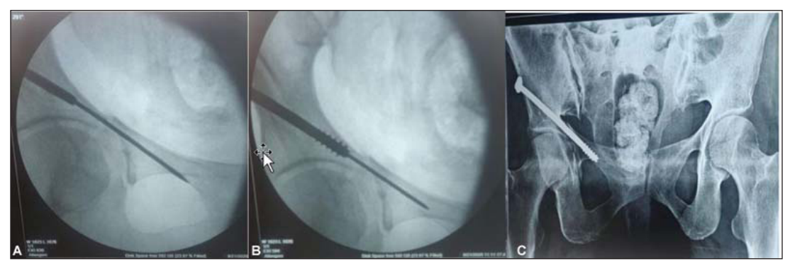
Figure 3: Percutaneous cc screw insertion for fixation of anterior acetabular column fracture. (A) Insertion of guide wire and drill bit, (B) insertion of cc screw, (C) final position of screw on postoperative X-ray.