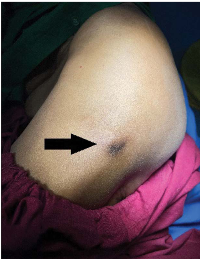
Figure 1: Swelling over the left hip on inspection as indicated by arrow.

On examination, a spherical swelling of size 4 cm × 3 cm × 2 cm approximately was noted over the greater trochanter of the left hip [Figure 1]. The swelling was hard and nodular in consistency, nontender on touch with no local rise of temperature, and non-transilluminating. The swelling was freely mobile in all directions suggestive of nonfixity to the underlying bone, with no overlying skin changes. No similar swelling was observed on other parts of the body. Systemic examination was within the normal limits. X-ray of the left hip joint was suggestive of a well-defined area of calcification lying over the greater trochanter of the left hip without underlying bony involvement [Figure 2]. A diagnosis of