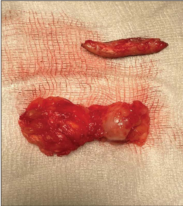
Figure 3: Dumbbell-shaped specimen excised in toto.