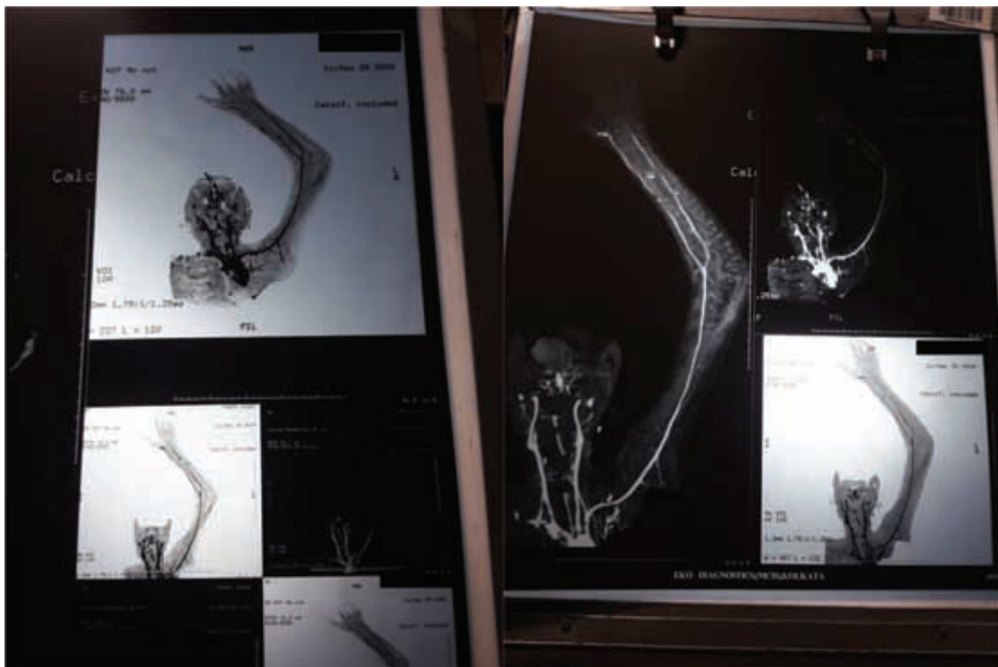
Fig. 2 CT angiogram left upper limb vessels. CT, computed tomography.

were normal. During the course of treatment with only ATD, his DVT condition started improving and there was gradual resolution of his left upper limb swelling.