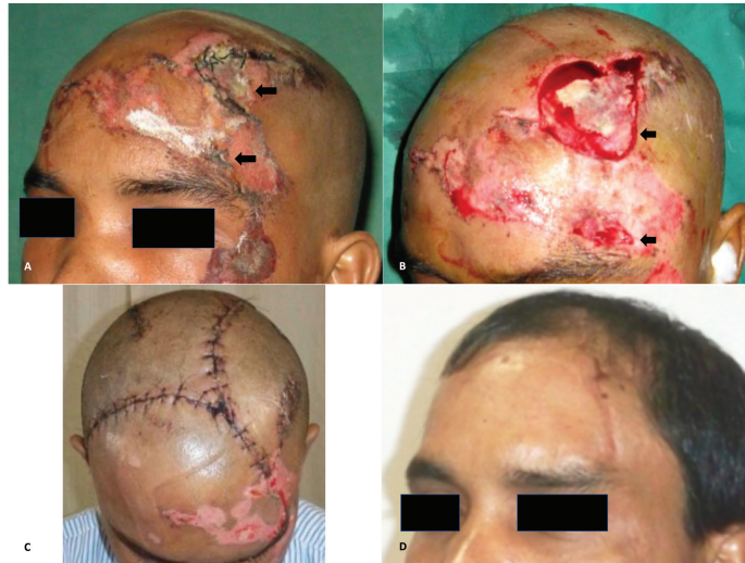
Fig. 2 (A) A 55-year-old man presented with a week-old injury with necrosed and rotten soft-tissues over the scalp and forehead (indicated with black arrows). (B) Debridement created an 8 cm × 5 cm defect involving the scalp and upper forehead and a smaller defect over the left eyebrow. (C) Result of forehead reconstruction with triple-plane dissection, involving significantly-sized flaps combining forehead and scalp. (D) Long-term result with an acceptable scar and no alopecia.

A 60-year-old lady presented to our clinic with a 3-month-old full-thickness injury involving all soft tissues and bone over her right forehead. An exposed, ulcerated, and infected frontal lobe of the brain was visible (►Fig. 4A). After adequate neurosurgical management, the 5 cm × 5 cm ulcer was covered primarily by a rotational flap combining forehead and