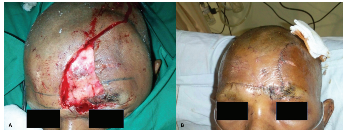
Fig. 3 (A) A 65-year-old man presented with a 6 cm × 4.5 cm defect over the left side of his forehead following an automobile accident. (B) Resulting suture lines after forehead reconstruction.