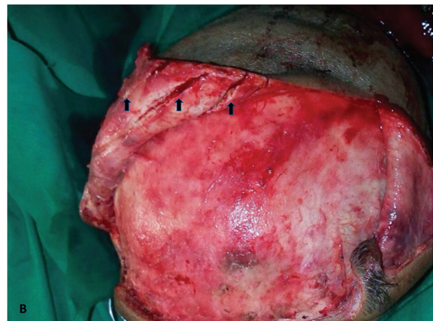
Fig. 1 (A) Triple-plane dissection, in subcutaneous, subgaleal, and subperiosteal planes, enables en bloc tissue advancement for covering large forehead defects without tension to flap margins. (B) Scoring of the galea perpendicular to the long axis of the wound easily allows tissue advancement toward the forehead defect.