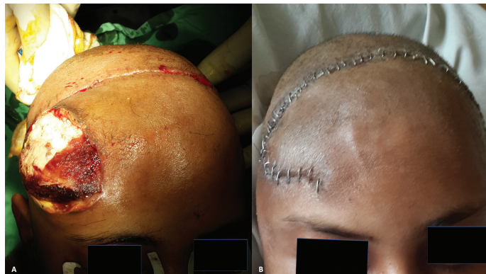
Fig. 4 (A) A 60-year-old lady presented with an old neglected 5 cm × 5 cm ulcer over her right forehead with an infected exposed frontal lobe of the brain. (B) Suture lines after reconstruction with triple-plane dissection, and significant forehead and scalp tissue mobilization.