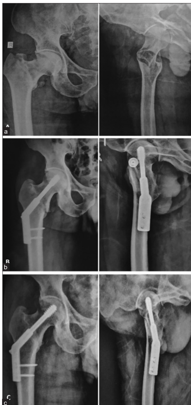
Figure 2: Anteroposterior and lateral images of case No 10. (a) Preoperative radiographs. (b) Postoperative radiographs. (c) Radiographs at 1 year showing union and maintained neck shaft angles.

All the patients were operated within 3 days of admission with a mean time interval of 2.1 \pm 0.47 days between admission and surgery. The operative time ranged from 25 to 60 minutes with a mean of 35.6 \pm 7.34 minutes. The length of skin incision ranged from 3 to 5 cm with a mean of 3.7 \pm 0.56 cm. The blood loss during the procedure ranged from 50 to 100 mL with a mean of 68.4 \pm 12.39 mL. Majority of the patients (84%) were discharged on the first postoperative day and the remaining 16% patients on second day. By 14 weeks, all the patients had full weight bearing. Fifty six percent patients bore full weight