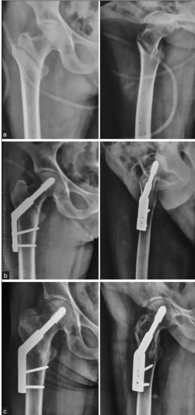
Figure 3: Anteroposterior and lateral images of case No 30. (a) Preoperative radiographs. (b) Postoperative radiographs. (c) Radiographs at 1 year showing union and maintained neck shaft angles.

other one had a deep infection that required re-exploration and debridement. Two patients (4%) had lag screw backout that lead to hardware symptoms and required removal of the hardware [Figure 4]. There was no case of screw cutout from the head or failure of side plate.