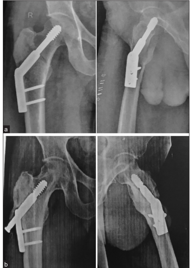
Figure 4: Complication. (a) Postoperative anteroposterior and lateral radiograph. (b) Radiographs at final follow-up of 1 year showing union, well-maintained alignment with backout of hip screw.

other one had a deep infection that required re-exploration and debridement. Two patients (4%) had lag screw backout that lead to hardware symptoms and required removal of the hardware [Figure 4]. There was no case of screw cutout from the head or failure of side plate.