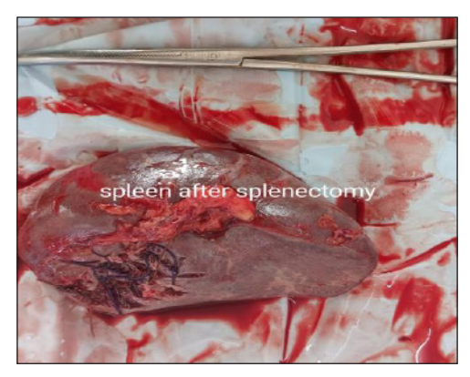
Figure 2b: Spleen after splenectomy.

deteriorated and could not be extubated after surgery. She developed asystole thrice intraoperatively and unfortunately died within an hour of surgery.