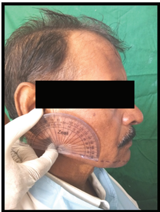
Fig. 3 Gonial angle.

United States). The mean Stp-Stg-Stgn angle was found to be 126 degrees whereas the mean value of FWS obtained through swallowing, phonetics, and no command methods was 2.606 mm (►Table 1). Reproducibility of the angle Stp-Stg-Stgn on the face was tested using Pearson's correlation test. The correlation between the angle, Stp-Stg-Stgn, and FWS was also determined using Pearson correlation test (►Table 2).