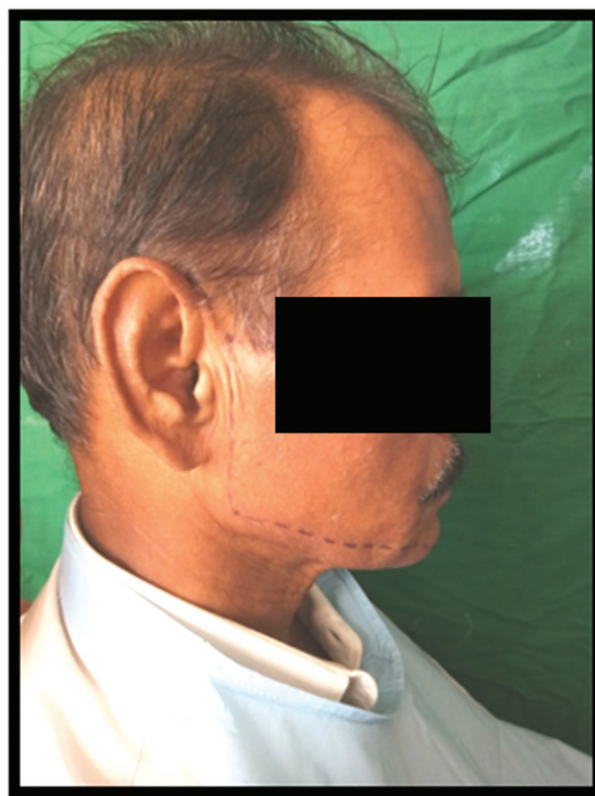
Fig. 1 Lateral profile photograph of the participant.

The participants were instructed to sit straight with their head in natural position achieved by asking them to look into the mirror hung on the wall at their eye level.