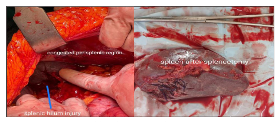
Figure 2: (a) Splenic rupture at hilum. (b) Spleen after splenectomy.

contraction, cephalic presentation, head 5/5 palpable, scar tenderness present, FHR = 124 bpm. There were no features of bleeding tendencies. Per vaginal examination = cervix 2 cm dilated, 50% effaced, fore bag of membrane forming, vertex high up, bilateral sidewalls convergent.