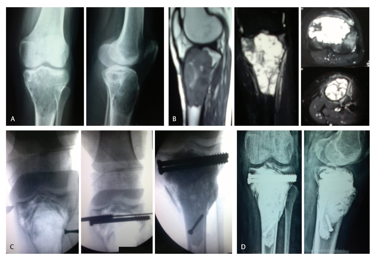
Fig. 1 Giant cell tumor of proximal tibia. ( A ) Radiographs showing lytic lesion. ( B ) Magnetic resonance imaging. ( C ) Intraoperative fluoroscopy showing placement of bone graft under subchondral bone, use of mantle screws, and filling the cavity with polymethyl methacrylate (sandwich technique). ( D ) Postoperative radiograph.