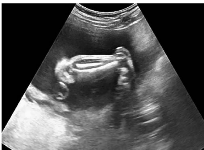
Fig. 6: Ultrasound image revealing club foot