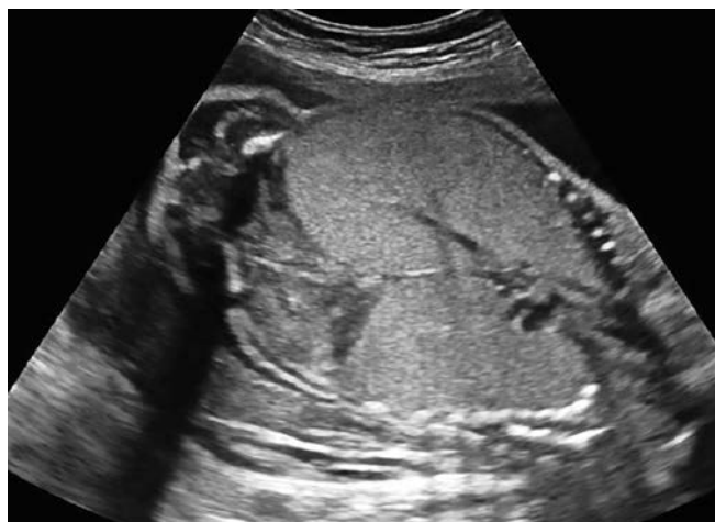
Fig. 3: Coronal ultrasound scan with bilateral enlarged echogenic lungs causing inversion of the diaphragm