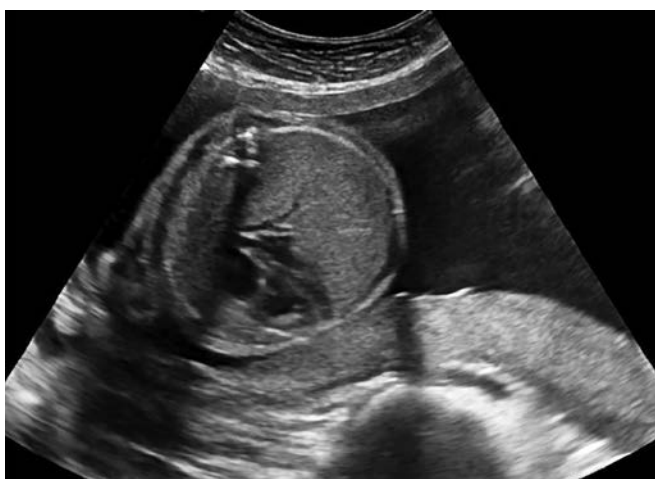
Fig. 4: Transverse ultrasound scan revealing central axis of the heart compressed between the enlarged echogenic lungs