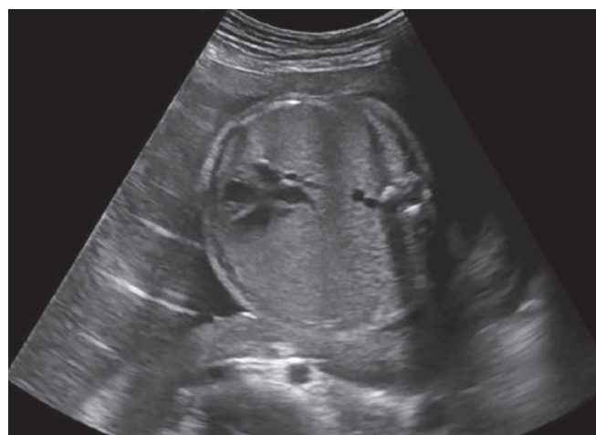
Fig. 1: Transverse ultrasound image with large echogenic lungs occupying whole of the thoracic cavity and causing compression of the heart

We explained the family of the patient about the possible unfavorable outcome and asked the patient for the autopsy of the fetus but family refused.