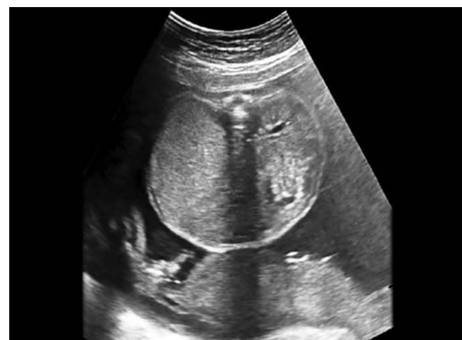
Fig. 5: Transverse ultrasound image with absence of right kidney