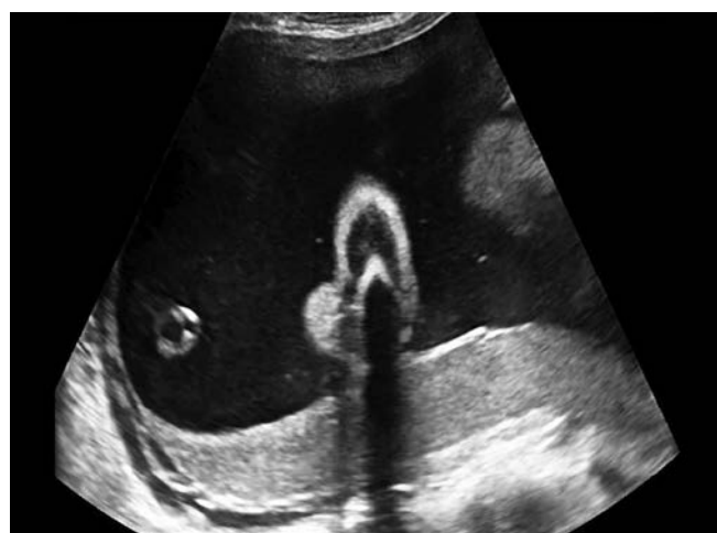
Fig. 7: Ultrasound scan revealing single large amniotic fluid pocket: Polyhydramnios