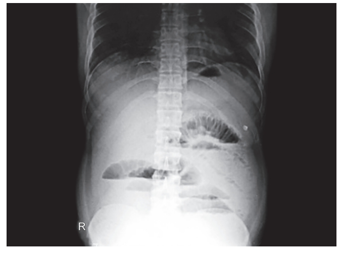
Fig. 1: X-ray erect abdomen: Showing air fluid levels suggestive of small bowel obstruction

A 57-year-old male patient was brought to casualty with complaints of diffuse pain and with distension of abdomen since 1 day. He had four episodes of vomiting and was not passing flatus and stool. Past history of patient revealed that he had undergone laparotomy for peptic ulcer perforation 4 years back. On examination it was found that the abdomen was distended with diffuse tenderness. X-ray of abdomen standing showed air-fluid levels and dilated bowel loops (Fig. 4). The diagnosis was confirmed as acute intestinal obstruction due to adhesions. Operative findings were of dilated loops from ileocaecal junction to mid jejunum. Faecolith was found at the distal ileum and enterotomy was done. Histopathological confirmation of faecolith showed vegetative material. The