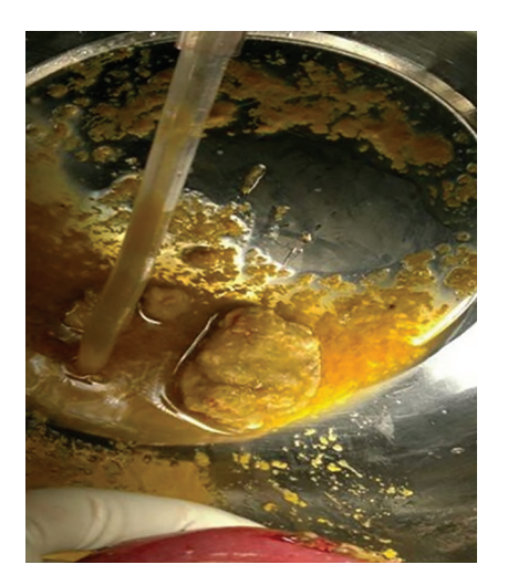
Fig. 5: Phytobezoar being removed after enterotomy

Clinically, the primary small-bowel bezoars always present as intestinal obstructions and usually become impacted in the narrowest portion of the small bowel, the most common site being the terminal ileum, as was found in our patients, followed by the jejunum.<sup>6</sup> More than half of reported cases of patients with phytobezoars had a history of gastric surgery.<sup>7</sup> But in our report there was only one patient with past history of gastric surgery and the other with gastric pull-up procedure. A plain abdominal radiograph typically shows a classical air-fluid levels suggestive of obstruction. Occasionally, we may be able to see the outline of a bezoar, which is actually difficult to differentiate from abscess or feces within the colon. Ultrasound has been used to detect bezoar. In a retrospective study done by Ripolles et al,<sup>8</sup> ultrasound was able to detect phytobezoar in 88% of patients with small-bowel obstructions, but in our study ultrasound was not helpful