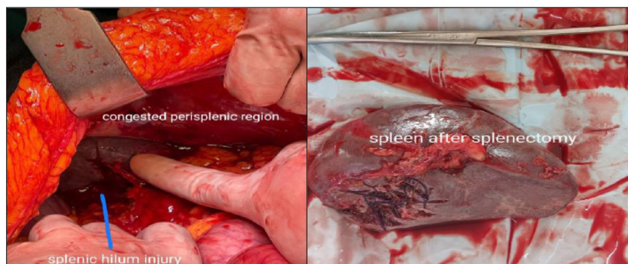
Figure 2: (a) Splenic rupture at hilum. (b) Spleen after splenectomy.

contraction, cephalic presentation, head 5/5 palpable, scar tenderness present, FHR = 124 bpm. There were no features of bleeding tendencies. Per vaginal examination = cervix 2 cm dilated, 50% effaced, fore bag of membrane forming, vertex high up, bilateral sidewalls convergent.