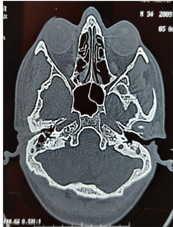
Figure 3: High-resolution computed tomography temporal bone axial cut showing extent of external wall bony erosion inferiorly.