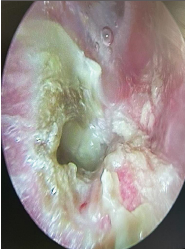
Figure 5: Attic cleared of all disease.

intact ossicles. Sinus tympani was clear and facial recess was intact and clear. Facial ridge was lowered, facial bridge was drilled, and epitympanum was inspected and turned out to be clear. Hypotympanic air cells were also identified. Haemostasis was achieved and right ear mastoid dressing was done. Postoperatively, the patient's symptoms were alleviated.