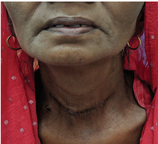
Fig. 2 Postoperative photograph of the patient.

Embryologically the median anlage develops from ventral surface of primitive pharynx between the first and second pharyngeal arch, whereas the lateral anlagen develop from the fourth and fifth pharyngeal pouches. Lateral anlagen fuse with