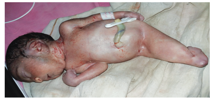
Fig. 1: Single fused lower limb, absent genitals, and absent urinary meatus

On examination, the baby was found to have multiple anomalies. There was complete fusion of both the lower limbs with a single foot and fused toes, absent genitals, absent urinary meatus, absent anal opening, single umbilical artery, and a vestigial tail-like structure at the sacrococcygeal area Figs 1 to 3. Other associated