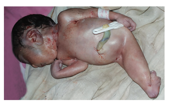
Fig. 2: Anomalous features, such as, single foot and fused toes