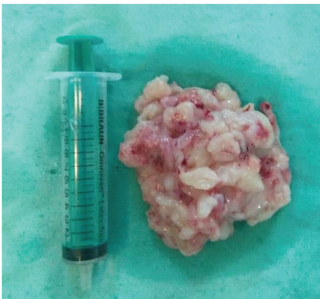
Fig. 3 Gross specimen of the nasal mass.

Since the tumor was benign in nature, decision of endoscopic surgical excision was made and the patient was planned for the surgery after due anesthesiologist and cardiac fitness. The tumor had a pedicle on the right nasal septum near the olfactory cleft, which we extirpated totally, leaving an adequate free margin. As the posterior part of the nasal septum was eroded, we performed posterior septectomy. The thick mucus in the ethmoidal sinus proved to be nonmalignant. Complete removal of the tumor in toto was possible with endoscopic surgery.