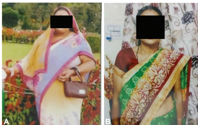
Fig. 1 (A) Case I: 6 months pre-op. (B) Case I: 14 months post-op.

A 51-year-old lady (►Fig. 1A) with hypertension, on two antihypertensives, and obstructive sleep apnea (OSA) with a body mass index (BMI) of 41.8 presented to the emergency department with right-sided abdominal pain, associated with nonbilious vomiting and low-grade fever for 2 days. On examination, she was found to be febrile, dehydrated, tachycardic, with maintained blood pressures, with a diffuse right hypochondrium and iliac fossa tenderness, positive Murphy’s and McBurney’s signs, and only voluntary guarding in the rest of the protuberant abdomen. Investigations revealed moderate leukocytosis, prerenal azotemia, and normal liver functions. She was admitted with a differential diagnosis of acute calculous cholecystitis/appendicitis, to rule out acute pancreatitis/adnexal pathology. An ultrasound abdomen revealed acute calculous cholecystitis with a concurrent acute appendicitis! These findings were confirmed on a contrast-enhanced computed tomography (CT), which additionally revealed an appendicolith at the base of the appendix. Given the short history, she was counseled regarding surgical options, which included laparoscopic versus open cholecystectomy, appendectomy with the addition of a suitable bariatric procedure. The risks and benefits of considering the procedures were explained to her and the family, and an informed consent for surgery as well as