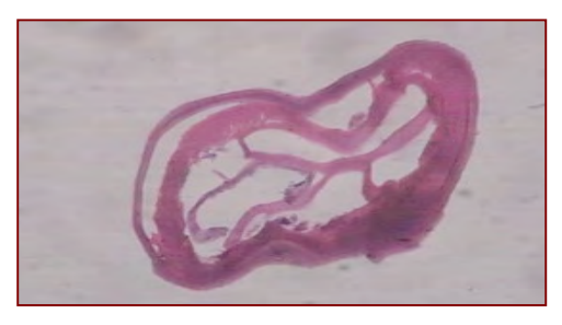
Figure Legend 3: Transverse section through a mature female Dirofilaria repens removed from the temporal limbus of a 65-year-old female (Case1). Characteristic features are the arrangement of the longitudinal muscles and the multilayered cuticle, which is expanded in the region of the large lateral chords.

and subsequent removal of the worm resolved the symptoms (12).