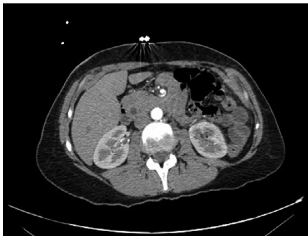
Fig. 1 Arterial phase in this image showing the superior mesenteric artery with its branches swirling pattern with no evidence of distal vascular compromise.