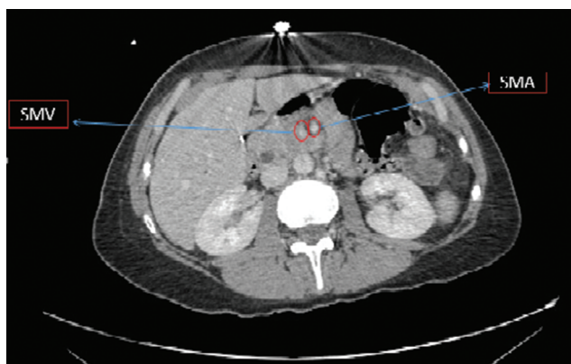
Fig. 2 Portovenous phase in this image showing the superior mesenteric vein (SMV) on the right compared with the superior mesenteric artery (SMA).