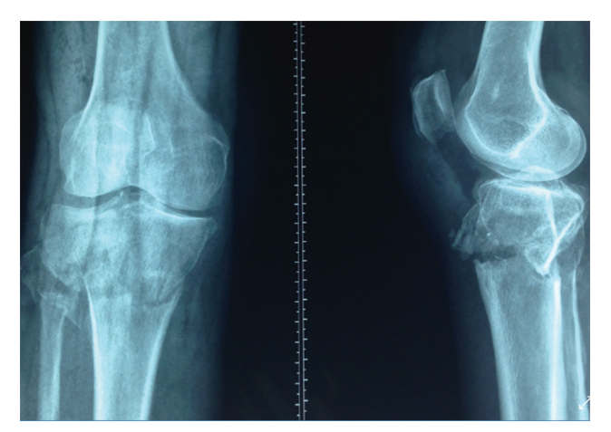
Fig. 1 X-ray showing Schatzker type 5 bicondylar fracture.