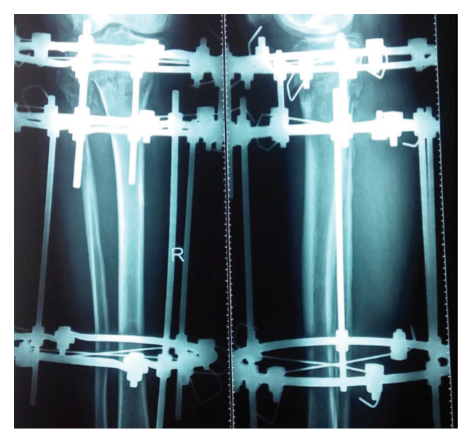
Fig. 2 Postoperative X-ray with Ilizarov frame in situ.

Demographic and incidence analyses were done. Correlation between various variables was done using the Pearson correlation. The value of chi-square was calculated. A p -value of less than 0.05 was considered to be significant.