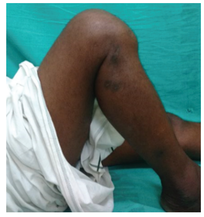
Fig. 4 Clinical picture showing near normal flexion of knee joint.

be meaningful, a classification should be simple, be easy to remember, and be relevant to both treatment and outcome.