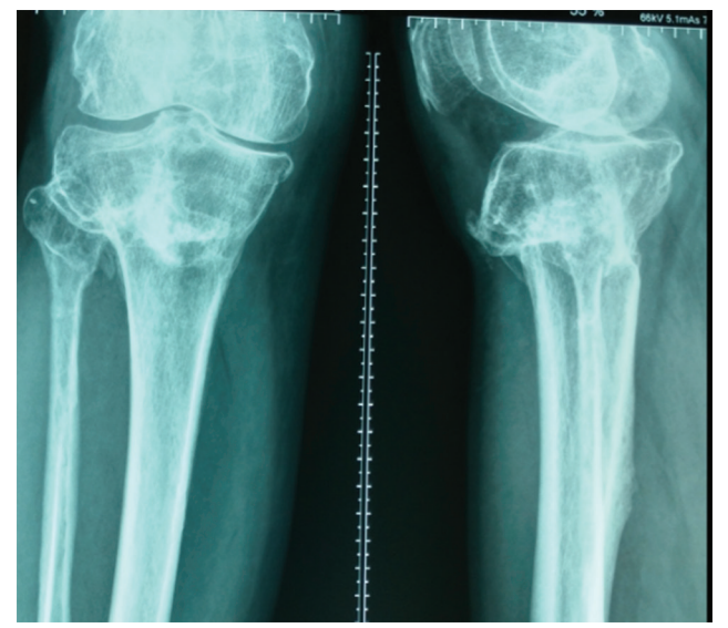
Fig. 3 X-ray showing union following implant removal.