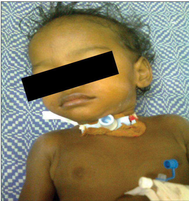
Figure 5: Child with tracheostomy tube.

the child underwent a direct laryngoscope which showed glottic and subglottic edema and endotracheal intubation could not be done. On examination, the patient was in stridor and air entry decreased on both sides.