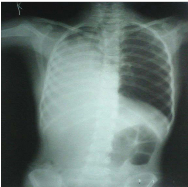
Figure 1: Chest X-ray showing atelectasis of right lung.

After all necessary investigations, the child was taken for surgery under general anesthesia, using a 4-mm rigid bronchoscope. Foreign body was visualized in the right main bronchus, but the foreign body could not be removed. A tracheostomy was done. Rigid bronchoscopy was introduced through the tracheostomy site and the foreign body was removed [Figure 2]. A 5 size Portex tracheostomy tube was