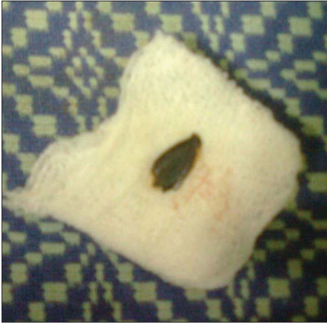
Figure 4: Removed foreign body—sapota seed.