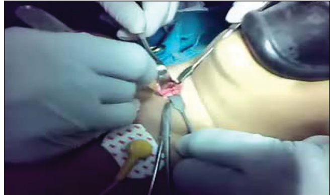
Figure 6: Procedure of tracheostomy.

Under general anesthesia, tracheostomy was done through which a 4-mm bronchoscope was introduced and the foreign body was removed. Portex tracheostomy tube was inserted