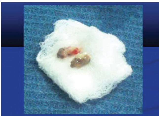
Figure 2: Removed foreign body—tamarind seed.