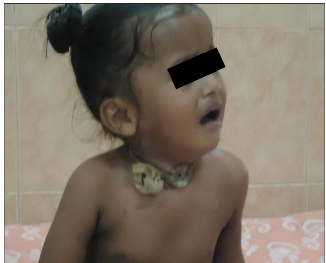
Figure 7: Child with metallic tracheostomy tube.

and secured [Figure 6]. Portex tube was changed into a metal tube after 3 days [Figure 7]. Direct laryngoscopy was done after 2 days, which showed normal glottis, subglottis, and supraglottis. Spigotting was done after 3 days. Strapping was done and the patient was discharged after 2 weeks.