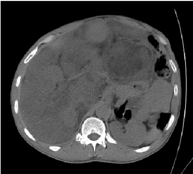
Fig. 1 CT scan showing the large retroperitoneal sarcoma with abdominal structures being displaced to the left. CT, computed tomography.