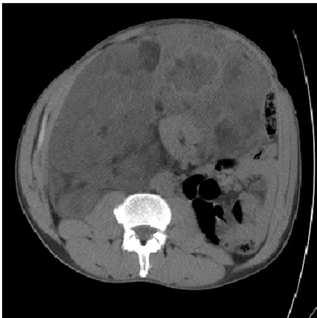
Fig. 2 CT scan showing the large retroperitoneal sarcoma. CT, computed tomography.

measured to be 48 cm × 31 cm × 12 cm. The position of the mass was displacing the anatomical structures and organs away from their natural position. In addition, the tumor was in contact with the right kidney, the inferior vena cava and the right renal vein causing mild dilation of the right pelvis of the kidney. Patient was scheduled for surgical excision of the mass with an R0 resection as the aim. Surgery performed with a generous midline incision from the xiphoid process to the pubic bone with extension to the right subcostal area (► Fig. 3 ). The tumor was exposed, displacing the right colon past the midline, with no clear cleavage plane in between. We opted for en bloc resection of the tumor, right adrenal, right