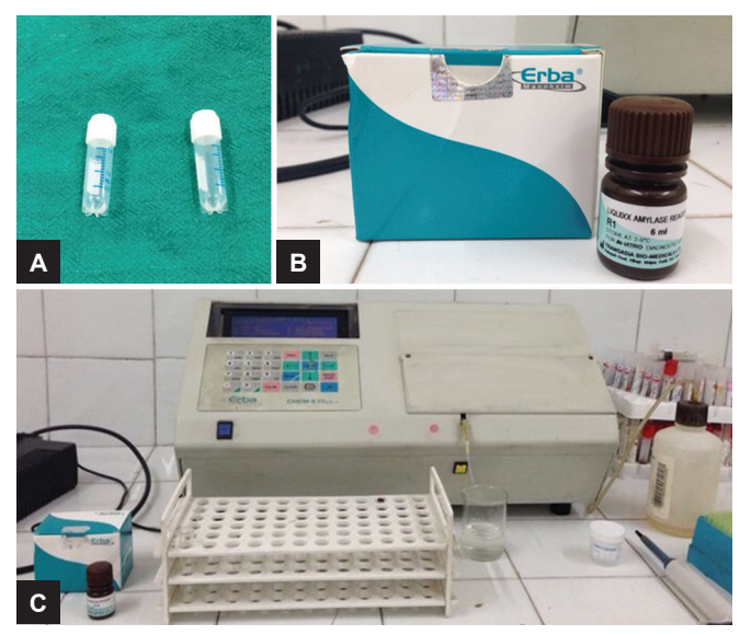
Figs 1A to C: (A) Fasting and postprandial salivary samples; (B) salivary amylase reagent (Erba); and (C) semiautomatic analyzer for salivary amylase estimation (Erba)

Although no significant difference was found in salivary amylase level between types I and II diabetic patients, the