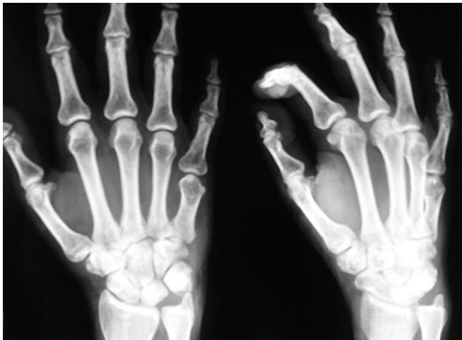
Fig. 2: Radiograph of right hand anteroposterior and oblique views of a 21-year-old male showing isolated short fifth metacarpal