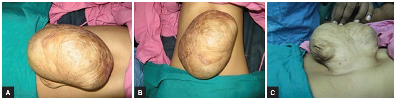
Figs 1A to C: (A) View of omphalocele from front; (B) horizontal view of omphalocele; and (C) view of omphalocele after retraction

the abdomen. Postoperative recovery was uneventful. Sutures were removed on 10th day. Regular follow-up was done. No evidence of any compartment syndrome or ventral hernia detected.