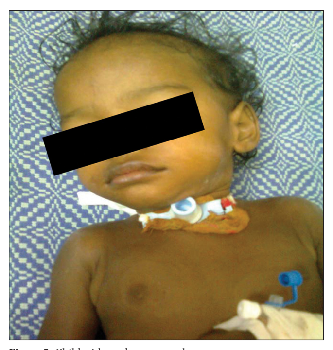
Figure 5: Child with tracheostomy tube.

the child underwent a direct laryngoscope which showed glottic and subglottic edema and endotracheal intubation could not be done. On examination, the patient was in stridor and air entry decreased on both sides.