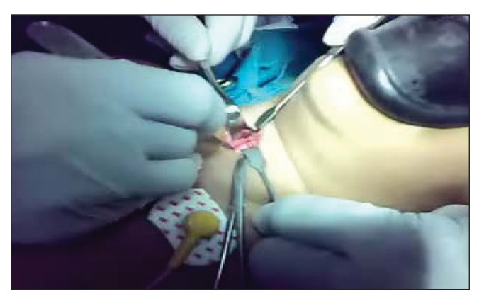
Figure 6: Procedure of tracheostomy.

Under general anesthesia, tracheostomy was done through which a 4-mm bronchoscope was introduced and the foreign body was removed. Portex tracheostomy tube was inserted