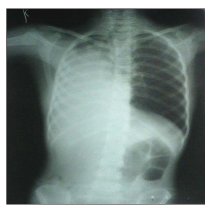
Figure 1: Chest X-ray showing atelectasis of right lung.

After all necessary investigations, the child was taken for surgery under general anesthesia, using a 4-mm rigid bronchoscope. Foreign body was visualized in the right main bronchus, but the foreign body could not be removed. A tracheostomy was done. Rigid bronchoscopy was introduced through the tracheostomy site and the foreign body was removed [Figure 2]. A 5 size Portex tracheostomy tube was