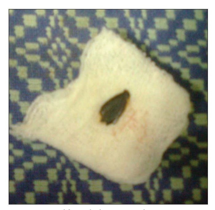
Figure 4: Removed foreign body—sapota seed.