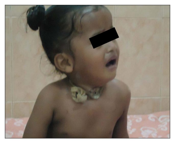
Figure 7: Child with metallic tracheostomy tube.

and secured [Figure 6]. Portex tube was changed into a metal tube after 3 days [Figure 7]. Direct laryngoscopy was done after 2 days, which showed normal glottis, subglottis, and supraglottis. Spigotting was done after 3 days. Strapping was done and the patient was discharged after 2 weeks.