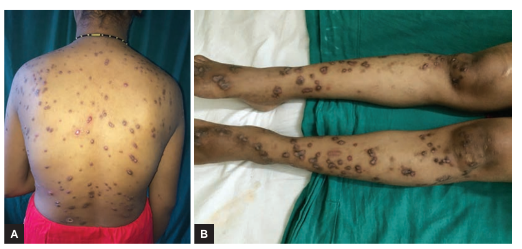
Figs 1A and B: A 28-year-old multigravida showing prurigo of pregnancy

Study of Specific Dermatoses of Pregnancy and Skin Diseases