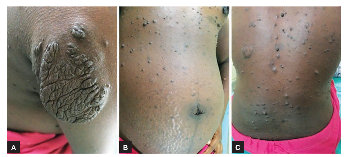
Figs 3A to C: Darier's disease regressed in a 30-week primigravida

Out of 400 pregnant females, 9.5% females had skin diseases that were due to by pregnancy. Study conducted by