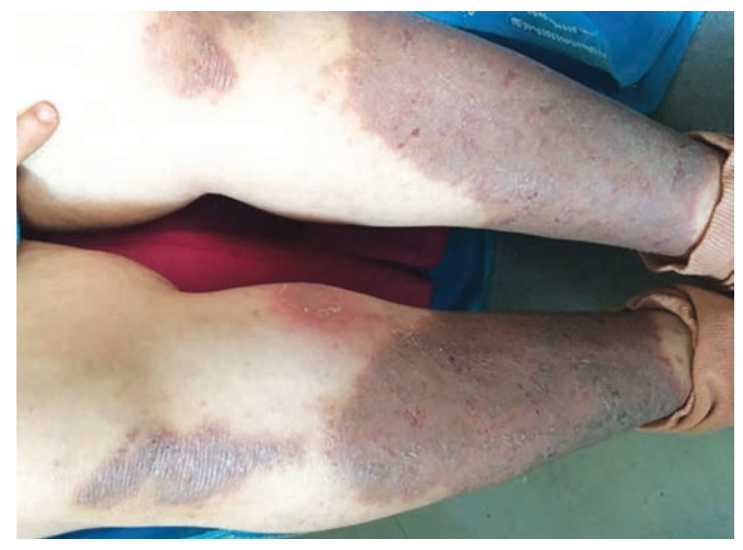
Fig. 4: Psoriasis vulgaris in a 3rd trimester female which showed regression during pregnancy

Kumari et al<sup>3</sup> reported that there were exacerbations in 0.83% cases of eczema, 1.9% cases of psoriasis, 1.1% cases in protein-losing enteropathy exacerbation of SLE, ichthyosis vulgaris in 0.16% cases, and neurofibromatosis in 0.4% cases. There was new onset of pemphigus and vitiligo in 0.16% cases. Diseases in which humoral immunity has a major role to play like atopic dermatitis are exacerbated, while diseases where cell-mediated immunity plays a role like psoriasis vulgaris, etc. might show regression.