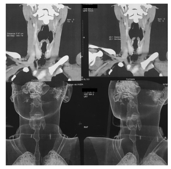
Fig. 3 Computed tomography scan imaging of a laryngotracheal stenosis.

signs of infection based on amoxicillin/clavulanic acid in a dose of 150 mg/kg per day for 8 days.