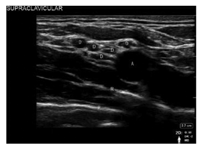
Fig. 2 Sonoanatomy of supraclavicular block with divisions of brachial plexus. A, subclavian artery; D, divisions; P, pleura; R, rib.

"honeycomb" appearance. There are two distinct appearances of the brachial plexus, one as a grape-like cluster of 5 to 6 hypoechoic circles, which represents the divisions of the brachial plexus ( ~ Fig. 2 ) or as three hypoechoic structures, which represent the trunks of the brachial plexus ( ~ Fig. 3 ). Pleura and first rib are visualized by increasing the depth of US. With the first rib in view directly beneath the brachial plexus, it can be used as a backstop to prevent inadvertent pleural injury. The artery should be visualized at all times while performing the block.