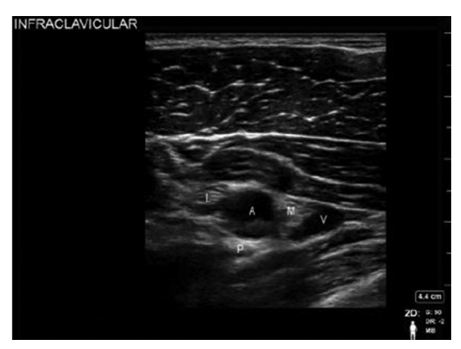
Fig. 3 Sonoanatomy of infraclavicular block. A, axillary artery; I, wwmedial cord; L, lateral cord; P, posterior cord; V, axillary vein.

spread of LA observed. Injection should be stopped in case patient complains of pain, paresthesia going down to the extremity, or resistance is met upon injection. In this situation, withdraw slightly, aspirate, and reattempt injection.