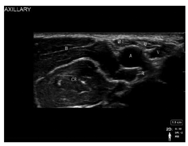
Fig. 4 Sonoanatomy of axillary block. A, axillary artery; B, biceps; CB, coracobrachialis; M, median nerve; R, radial nerve; U, ulnar nerve; V, axillary vein.

with stimulation of the median or musculocutaneous nerves. Direct needling of the medial cord is usually not necessary nor recommended due to its precarious position. With each needle positioning, the anesthetist may utilize peripheral nerve stimulation to confirm the target. Nerve stimulation is helpful in this block because the cords are deeper than the more proximal brachial plexus and harder to visualize.