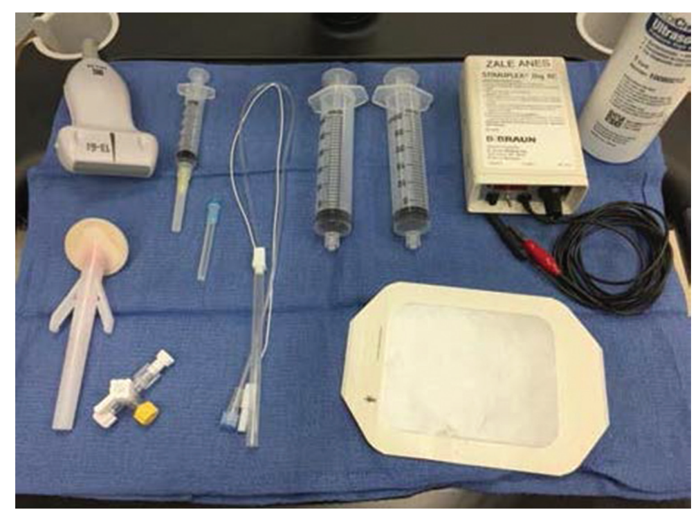
Fig. 1 Basic equipment for regional blocks.