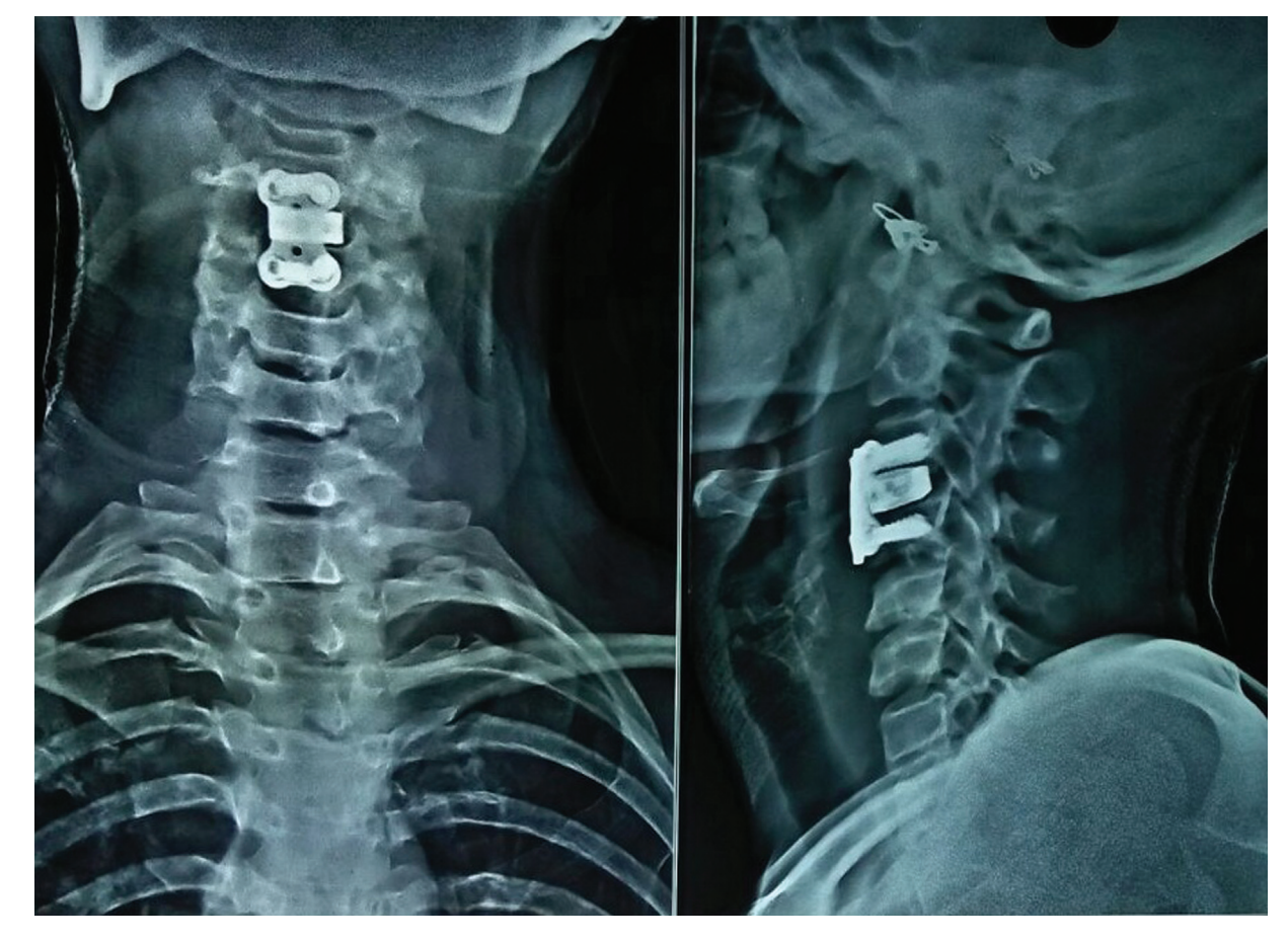
Fig. 1 Postoperative X-ray of one of the patients of group A.