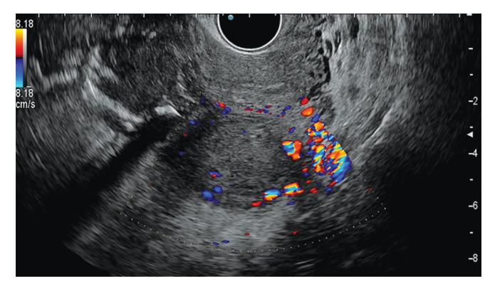
Fig. 4: Color Doppler showing vascularity of placenta