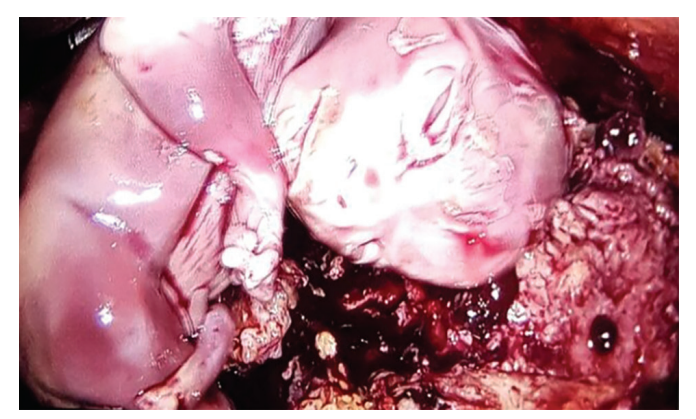
Fig. 6: Intraoperative photographs showing crumpled fetus