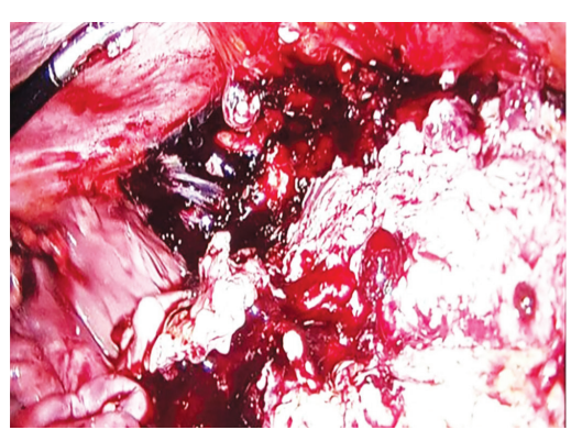
Fig. 5: Intraoperative photographs showing placenta

About 21% of babies born after an extrauterine abdominal pregnancy have peculiar birth defects, presumably due to compression of the fetus in the absence of amniotic fluid buffer. Typical deformities include limb defects, facial and cranial asymmetry, joint abnormalities, and central nervous malformation.<sup>5</sup> Ovarian and abdominal ectopic pregnancies are quite rare. On real-time ultrasonography, ovarian ectopic pregnancies move with respect to the ovary, not separately. Abdominal