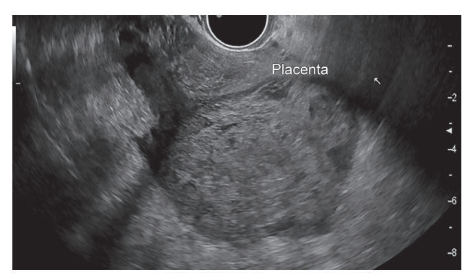
Fig. 2: Ultrasonography shows extrauterine placenta